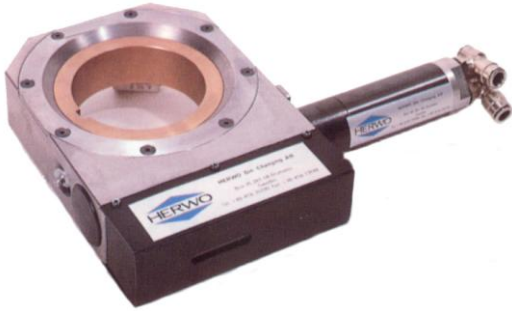
Above: Drive unit for motorised slide adjustment.

QS – Slide adjustment has been designed to facilitate shorter adjusting time of the slide on excenter presses.