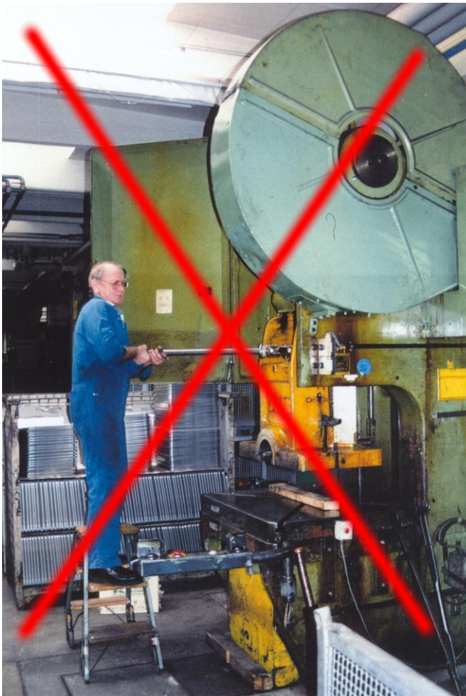
Below: Spares the personnel from adverse working postures and makes setting of dies an uncomplicated task for all operators. Adjusting time 80 mm / min. Accuracy: not less than 1/10 mm.

Prevents too tight/deep set dies, thus sparing the dies and presses from unnecessary wear.