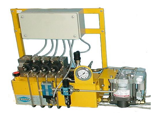
The Aggregate in the picture is additionally equipped with a larger pump.

HLA is easy to install and adaptable to various circuits and functions.