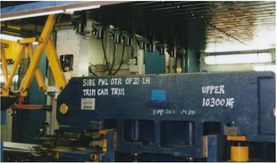
Above: All HTC clamps in parking position.

Description: A hydraulic clamp is automatically pushed in and out, by an electric run chain. The chain as well as the hydraulics stays protected within the T-slot where the clamp runs. The clamp is pushed towards the die until it reaches the end position. This is detected through a sensor. A signal indicating automatic clamping is then transferred to all clamps.