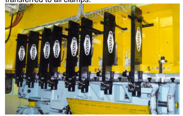
All HTC clamps in parking position.

Description: A hydraulic clamp is automatically pushed in and out, by an electric run chain. The chain as well as the hydraulics stays protected within the T-slot where the clamp runs. The clamp is pushed towards the die until it reaches the end position. This is detected through a sensor. A signal indicating automatic clamping is then transferred to all clamps.