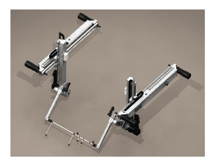
Double UniFeeder PTP with crossbar tooling.