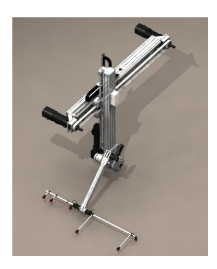
UniFeeder PTP with single or double tooling.